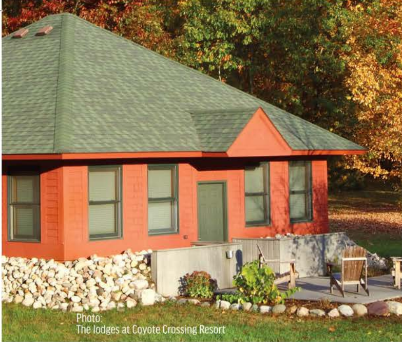
Photo: The lodges at Coyote Crossing Resort