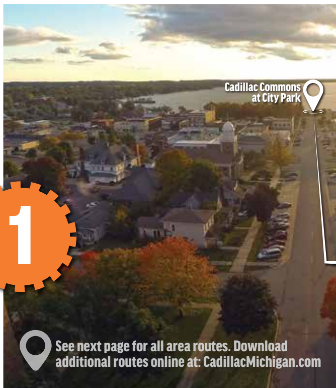
Cadillac Commons at City Park