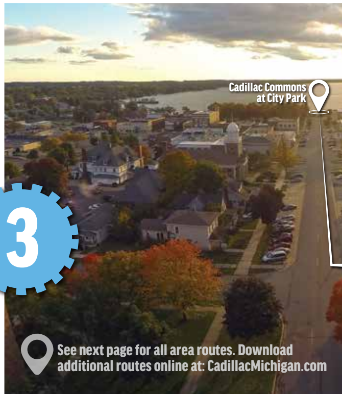
Cadillac Commons at City Park

See next page for all area routes. Download additional routes online at: CadillacMichigan.com