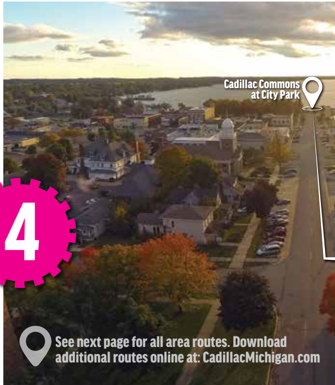
Cadillac Commons at City Park