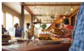
[BRUNCH, DINNER, FINE DINING, FULL BAR] GROUP CAPACITY: 200

Come as you are to the newest addition at Evergreen Resort. Enjoy the best Sunday brunch in town, chef selected hand-cut steaks or craft beer selections. Your American favorites made with Michigan inspired flavors and regionally sourced food are sure to satisfy.