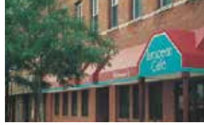
[LUNCH, DINNER, FULL BAR] GROUP CAPACITY: 55

Hermann's European Café is known all around the world for its Austrian and German food. Hermann's offers an eclectic menu featuring selections from all over the world. Open from Memorial Day to Labor Day Noon-9p.m. and lunch specials from 11a.m.-2:30p.m. Thursday night Sushi year around.