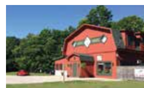
[LUNCH, DINNER, CASUAL, FULL BAR] GROUP CAPACITY: 50

A rustic family restaurant offering a full menu, spirits, live entertainment and now a smoker to perfect barbeque ribs, pulled pork and more. Within minutes of Caberfae and right on the snowmobile trail, this oasis in the woods is sure to be a treat. Now open for breakfast Sat-Mon.