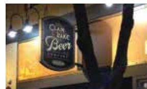
[LUNCH, DINNER, CASUAL, FULL BAR] GROUP CAPACITY: 50

Clam Lake Beer Co. is an exciting 139-seat tap house/restaurant. The bar, tables and stools evoke the early industrial feel of Cadillac while the custom metal artwork, lighting, exposed brick and wood flooring are all visual call outs. Over 40 taps-always available.