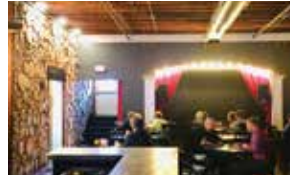
[LUNCH, DINNER, CASUAL DINING, FULL BAR] GROUP CAPACITY: 90

Private Parties up to 90. Coming soon upstairs, fine dining.