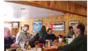
[LUNCH, DINNER, CASUAL DINING, FULL BAR]

R Dub's Pub, located on the upper level of the Blackmer Lodge, is the perfect place to grab a bite to eat and drink while you're at the Peaks. Try one of our fantastic appetizers, sandwiches or burgers and award-winning fries.