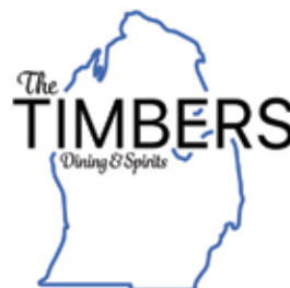
[LUNCH, DINNER, CASUAL DINING] GROUP CAPACITY: 50

A family owned and operated restaurant since 1991. Daily features cooked to order. Hand-cut, slow-roasted prime rib. Mouth watering steaks, fresh water fish and seafood. House recipe sauces for pasta and pizza made from scratch. Michigan craft beers on tap.