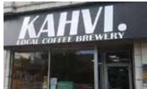
[BREAKFAST, LUNCH] GROUP CAPACITY: 50

Cadillac's Downtown Coffee Destination. Located in the middle of it all - Mitchell Street and Cadillac Commons. A little piece of coffee heaven tucked away for the locals and tourists alike. Offering extensive coffee, breakfast and deli selections. Lunch served all day. Free WIFI.