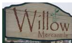
[SPECIALTY FOOD MARKET, EATERY]

Willow Mercantile is a specialty food and kitchen essentials market with a seasonal plant nursery located on over one-and-a-half acres at the south end of Cadillac. Willow carries 550+ craft beers and 300+ wines, many of them from Michigan. Now offering a full deli and dine in area!