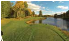
[LUNCH, DINNER, CASUAL, FULL BAR] GROUP CAPACITY: 200

Enjoy an atmosphere you can't get anywhere else at the Lakewood Grill. Open Monday-Saturday from 5-9 p.m. all summer long, offering happy hours, pizza specials and beers on tap. Also check us out for special events and entertainment.