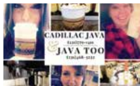
[BREAKFAST, LUNCH, DINNER]

Two Specialty Drive-Thru Coffee Shops offering fresh espresso, premium coffees, frozen, iced and blended drinks, ice cream, chai teas and more. Please note each location store hours may vary.