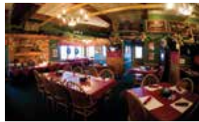
[LUNCH, DINNER, CASUAL, FULL BAR] GROUP CAPACITY: 150

Adorned with boating and lake living décor, Lakeside offers American cuisine, lunch and Sunday buffets, private party packages, a beautiful lakeside patio, as well as a separate dining room from Charlie's Lounge. The lounge provides a line of craft beers to top shelf liquor.