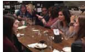
GROUP CAPACITY: 50

Offering over 2,800 bottles of wine anywhere from Michigan to Australia, Table 212 has got it. Hang out with friends and enjoy the palate. Placed between Hermann's European Café and Opa's Butcher Shop, Table 212 is a must when visiting Cadillac.