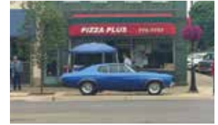
[LUNCH, DINNER, CASUAL DINING]

Famous for its thin, crispy crust, Pizza Plus has been a staple of Downtown Cadillac for over 50 years. Pizza Plus is a family owned and operated business where everything is homemade and the pizza is baked to perfection. Pizza Plus offers Carry-Out or Dine-In services and gluten free options.