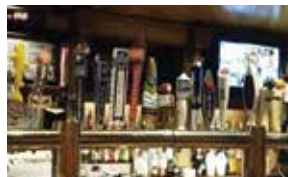
[LUNCH, DINNER, CASUAL, FULL BAR]

Now offering over 20 brews including majors and craft on tap, this sports type bar downtown is the place for game night while enjoying a great steak, burger and beer.