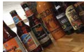
[SPECIALTY FOOD MARKET, EATERY]

Rosa Blanca is a Wine and Craft Boutique offering a variety of fine wines, craft beers, spirits & premium cigars. Now offering a menu of specialty pizzas and a deli! Offering daily Texas Style Pit BBQ.