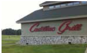
[LUNCH, DINNER, CASUAL/FINE, FULL BAR] GROUP CAPACITY: 300

Open to the public, the Cadillac Grill offers an atmosphere unique to its own. With a scenic view of the fairways of the Eldorado, outdoor seating, and seasonal menus as well as a state-of-the-art kitchen and grill, you'll enjoy this Northern Michigan experience.